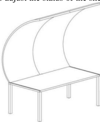
Figure 1 Shelter Functioning as Canopy

The bench is mainly composed of shelter and the seat (Figure 1). The shelter is fixed on the seat through slot with two independent parts connected by batten, i.e. the left part and right part; a universal joint yoke is respectively set on the left bottom of the left shelter and right bottom of right shelter to adjust the status of the shelter.