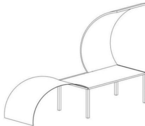
Figure 2 Shelter Functioning as Fitness Equipment

Slots are set on both sides of the seat; when the batten in the middle is removed, the shelter can be adjusted through the universal joints to form fitness equipment with the shelter bottom fixed in the slot at the edge of the seat. On the fitness equipment formed by the shelter, people can do excise with back lean against the arc or do leg pressing (Figure 2); Conversion from shelter to fitness equipment is easy to operation with high security, and visitors can adjust according to their needs.