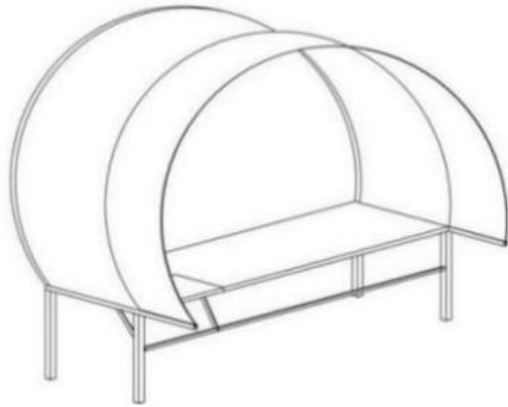
Figure 1 Bench with Fully Expanded Shelter

In addition, the foldable shelter is set on the back with two layers, and pulleys are provided on the bottom edge of the shelter to realize spreading of the two layers of shelter through sliding on slideway. Foldable shelter design can realize shelter coverage adjustment according to people needs (Figure1, Figure 2).